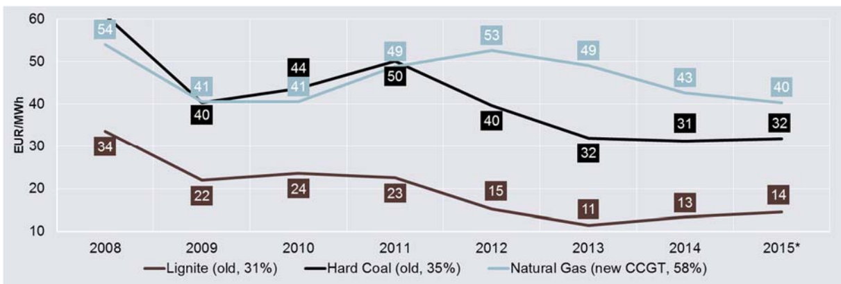
Figure 1. Short-run marginal costs of fossil power plants in Germany; 2008 – 2015. The bracketed numbers denote average plant efficiency. Costs include CO 2 costs.

Figure 1 shows that current market conditions yield high generation costs for gas-fired plants and low costs for coal-fired power plants. Even inefficient old coal plants currently produce at lower costs than the newest and most efficient gas-fired plants. As a result, when there is more capacity than demand it is the newer, more flexible and lower emitting natural gas plants that are pushed out of the market.