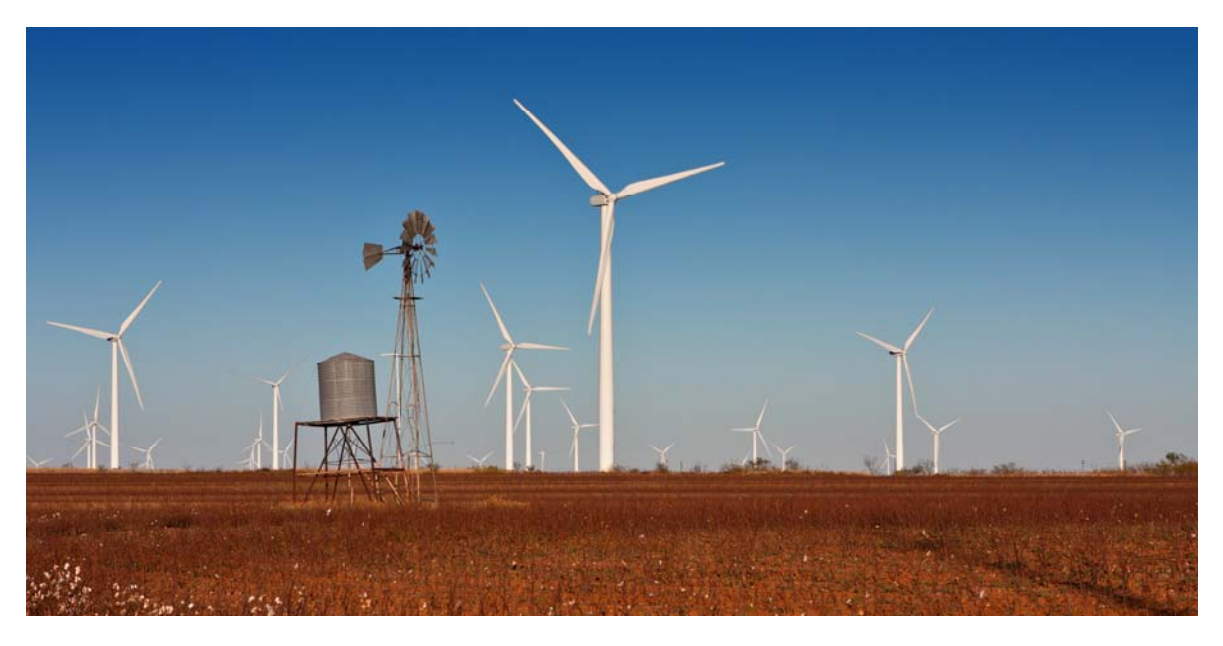
Wind turbines in a rural West Texas field

The implementation of Texas's Competitive Resource Energy Zone (CREZ) initiative is another proof that competitive initiatives can produce cost-effective transmission results. In 2005, the Texas legislature and then-Governor Rick Perry mandated the CREZ initiative. The Public Utility Commission of Texas (PUCT) implemented the program, which included creation of CREZ zones, designation of transmission types and transmission service providers (TSPs) competitively selected for each zone, with authorization of TSP tariffs. The PUCT adopted rules and standards to ensure that ratepayers' investment in CREZ transmission would be used by multiple wind developers. Texas demonstrated that coordinated planning implemented through a series of competitive procurements for transmission works. Through CREZ, the PUCT and ERCOT connected wind-rich sections of Texas with the state's load centers.<sup>29</sup>