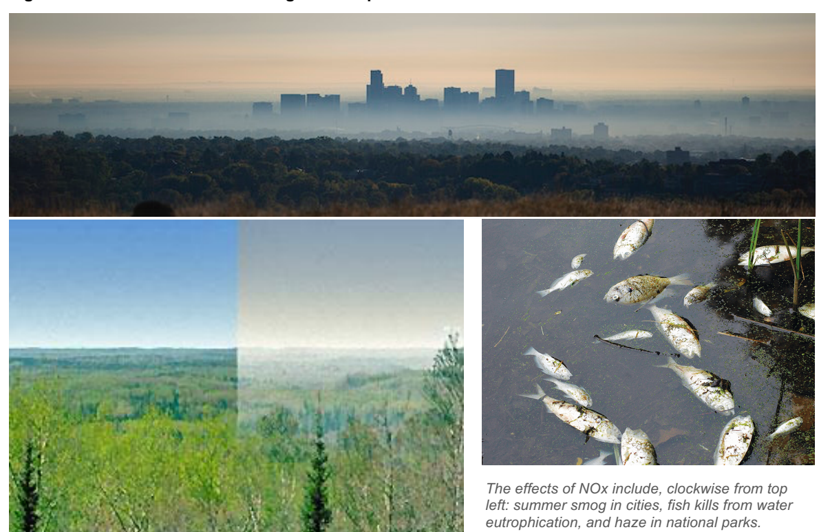
Figure 1. Harmful effects from nitrogen oxide pollution

Third, because of the air quality impacts of NO_x , air quality agencies (local, state and federal) have spent decades, since the 1970s, regulating NO_x emissions. They have primarily regulated the largest emissions sources, such as power plants and light-duty vehicles, but as public health standards get more stringent and the technological options to further regulate these large sources diminish, air quality agencies have looked for cost-effective ways to regulate NO_x emissions from consumer products and other small emissions sources. As discussed below, fossil-fueled appliances represent an underregulated source of NO_x emissions. Though they represent just a small percentage of total NO_x national emissions, there are appliances in almost all homes using fossil fuels and emitting NO_x . These appliances warrant a closer look, particularly if emissions reductions can be achieved cost-effectively compared to other available options.