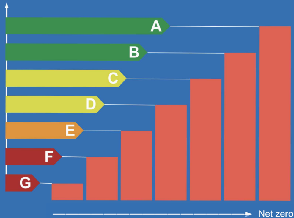
Illustration of an incrementally increasing minimum energy performance standard by energy performance certificate class

Renovations currently achieve on average only 9% to 17% energy savings